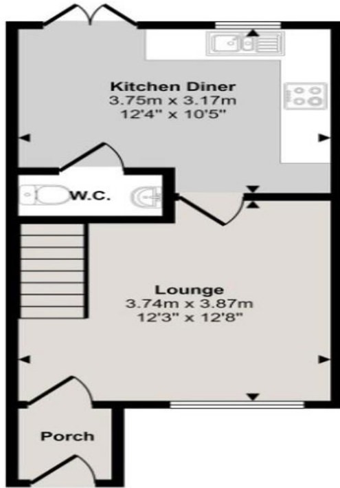
Ground Floor Approx 29 sq m / 309 sq ft

Approx Gross Internal Area 56 sq m / 605 sq ft